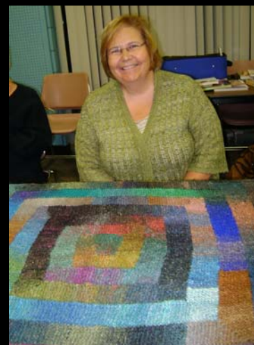
Terrie's 10-stitch blanket by Frankie Brown. Noro Silk Garden yarn.