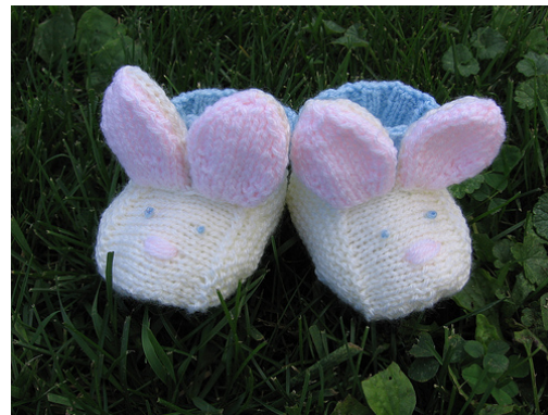
Knitted Bunny Booties by Cleckheaton