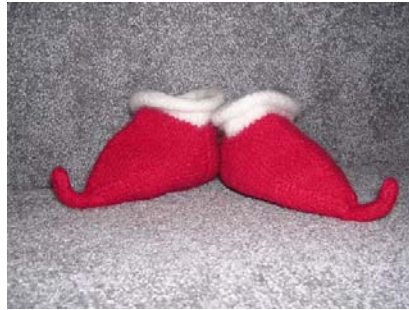
Elf Feets by SJ