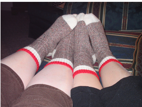
Mystery Monkey Socks by Socks for Mum