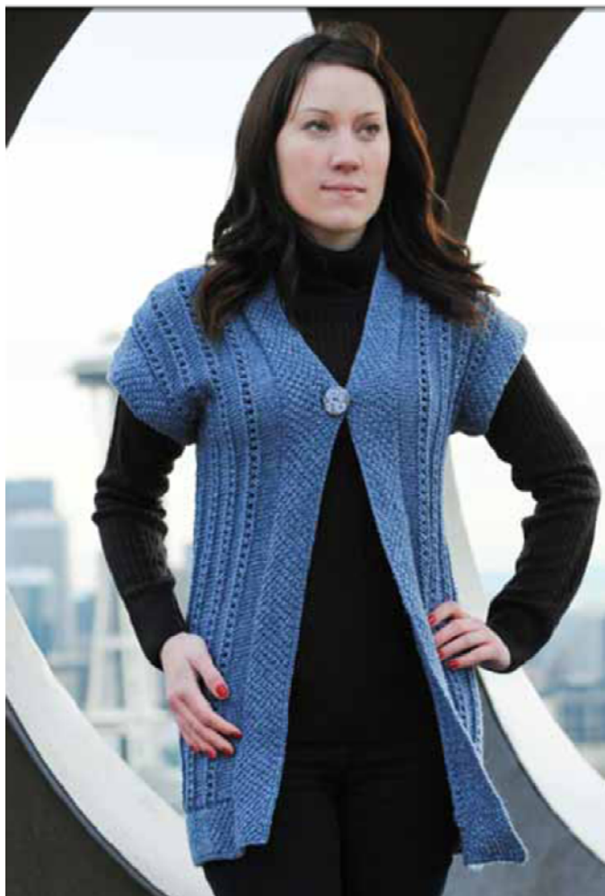
Horizontal Vertical Kimono

http://www.cascadeyarns.com/patternsFree/W243_220Superwash.pdf